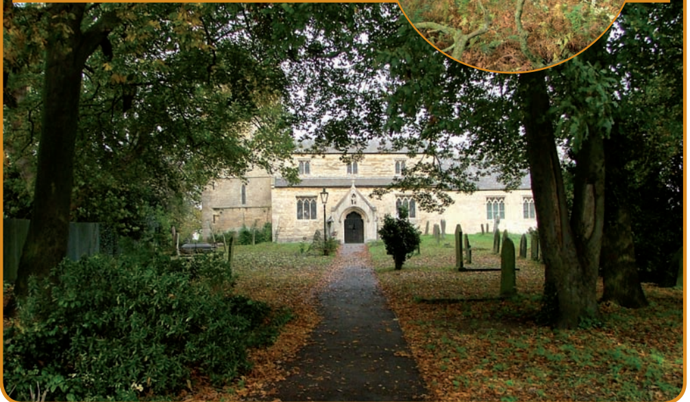
St Chad's church, Dunholme