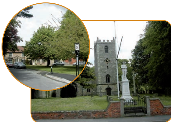
St Mary's church, Welton

This leaflet has been produced in partnership with Welton-by-Lincoln Parish Council.